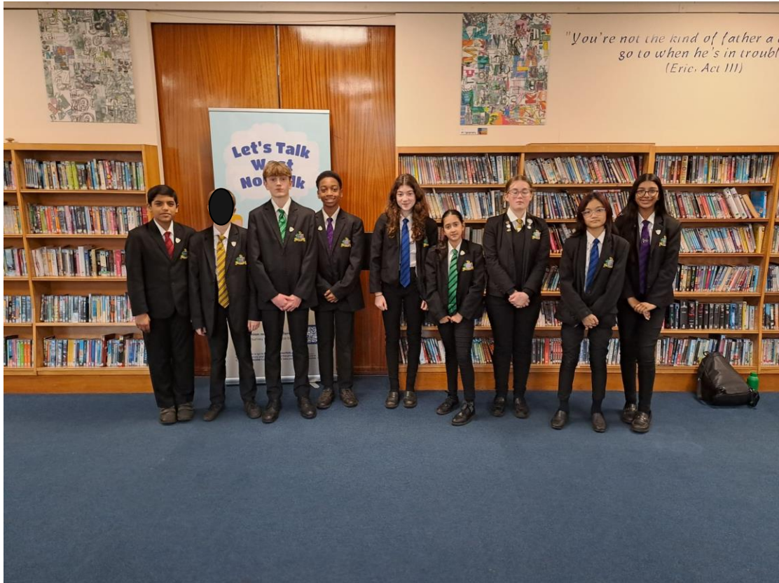
Pictured above are the new members of the Year 8 Council, just after they received their Year Council badges.