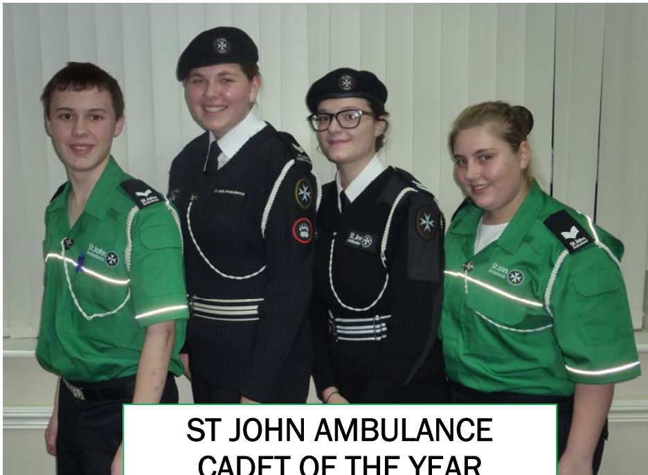
ST JOHN AMBULANCE CADET OF THE YEAR

I have been in the St John Ambulance since I was aged 6 years, I worked my way up from being just a cadet to a Sgt and have a BTEC peer education certificate. I really enjoy the challenge and the commitment, I attend the Norfolk show, fetes, banger racing and other seasonal events and have achieved 200 duty hours. On the 23 rd November 2013 I took part in a competition to win Cadet of the Year for a district within the East of England. The competition took place in Newmarket and I was up against two other people. We had many challenges to do throughout the day including; team tasks, interviews, uniform inspections, first aid assessments and presentations. I really enjoyed the day. When they were reading out the winners from each of the districts I didn't think it was going to be me. I was over the moon to win this and I'm happy for the year ahead as it is my year to make a difference. I am looking forward to the National competition in March 2014.