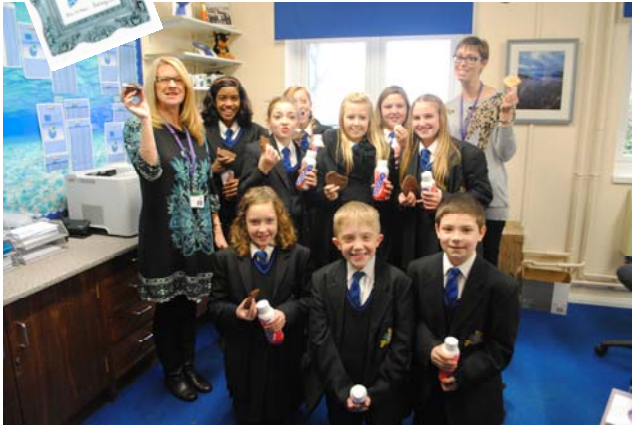
Year 7 Holkham Harlequins flying high with Average ATLs of 1—fantastic first term at Springwood. Well Done