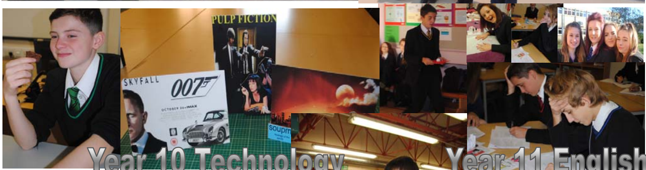
Year 10 Technology